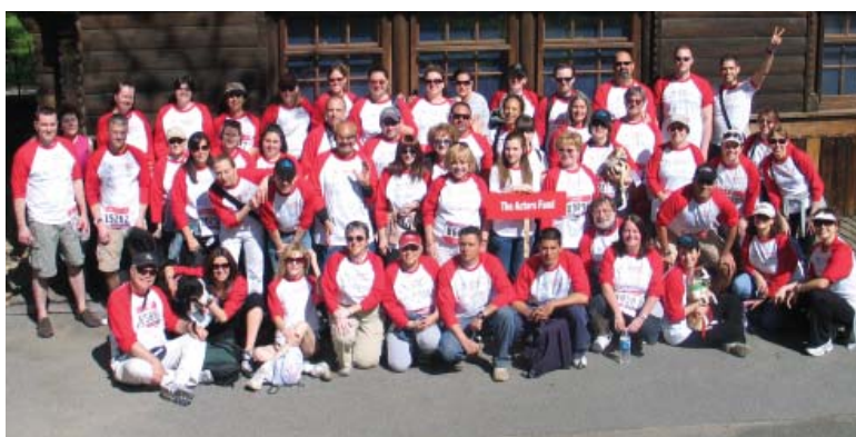
NEW YORK - The Actors Fund team in Central Park during the annual Revlon Run/Walk on May 5th in New York. More than 125 walkers and over 60 volunteers turned out to participate in the event which helps raise support for The Fund's Phyllis Newman Women's Health Initiative. Thanks to our major and generous supporter EIF—the Entertainment Industry Foundation—for this project.