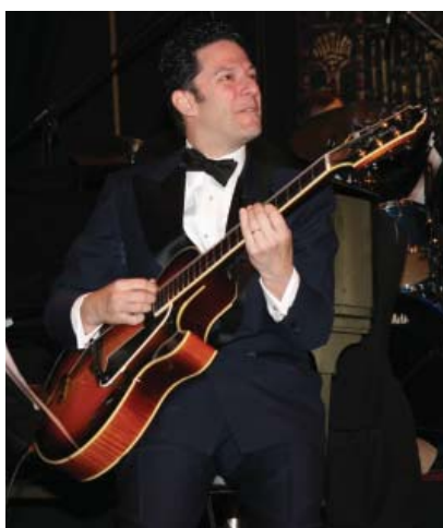
John Pizzarelli performing with his 16-piece band at The Actors Fund gala