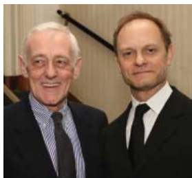
David Hyde Pierce and John Mahoney entertained at The Actors Fund 125th Anniversary Gala at the Waldorf=Astoria in New York on April 30th