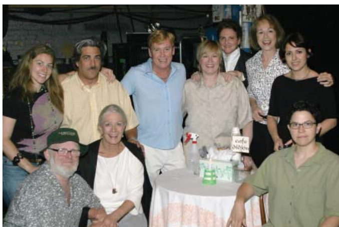
Vanessa Redgrave and the company of THE YEAR OF MAGICAL THINKING following their June Special Performance in New York