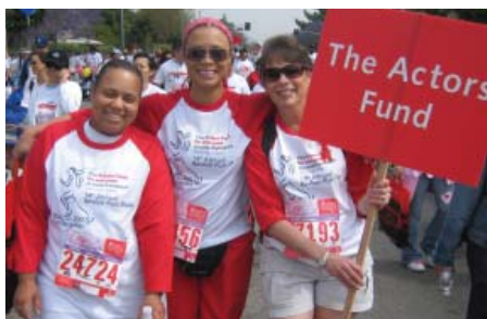
LOS ANGELES - The Actors Fund participated in the Los Angeles Revlon Run/Walk for the first time ever, joining thousands of runners and walkers on May 12th at the Los Angeles Memorial Coliseum