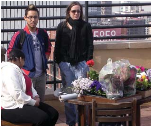
Volunteers from Starbucks arrive at The Aurora to begin work on the roof garden

The monthly seminars grew into a relationship that has seen Starbucks volunteers serving Thanksgiving dinner, making friendly visits and running errands for tenants and, this spring, sprucing up The Aurora's roof garden.