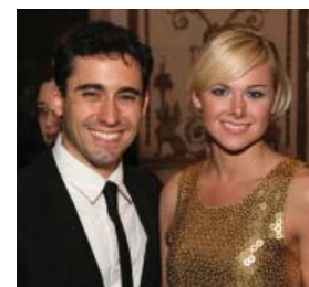
John Lloyd Young (JERSEY BOYS) and Laura Bell Bundy (LEGALLY BLONDE) at the Gala pre-dinner cocktail party