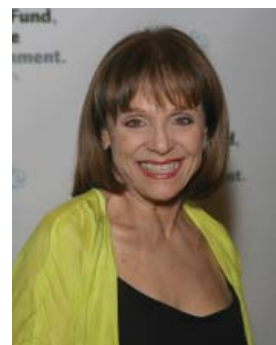
Valerie Harper arriving at the Gala