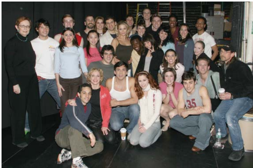
The cast and company of A CHORUS LINE following the March 25th Special Performance