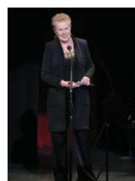
Left: Actors Fund Trustee Lynn Redgrave accepting special recognition on behalf of The Fund at this year's Helen Hayes Awards ceremony in Washington, D.C. Above left: Actors Fund Trustee Bebe Neuwirth with stage and television actor Bobby Cannavale at this year's Lucille Lortel Awards