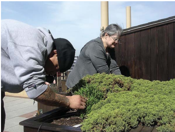
Residents and volunteers worked together to plant the flower boxes