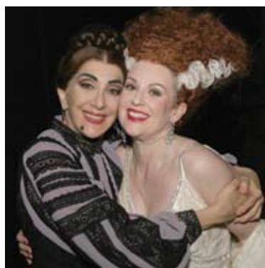
Backstage with Andrea Martin and Megan Mullally at their February Special Performance of YOUNG FRANKENSTEIN

Actors Fund Special Performances are an 81-year theatrical tradition and raise significant support for The Fund’s programs. Thanks to the casts, crew, musicians, front-of-house and company management for donating their time and talents to make this possible.