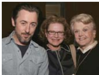
Alan Cumming, Dianne Wiest and Angela Lansbury at THE HOMECOMING