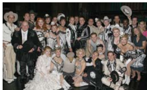
The cast and crew and personnel of CURTAINS