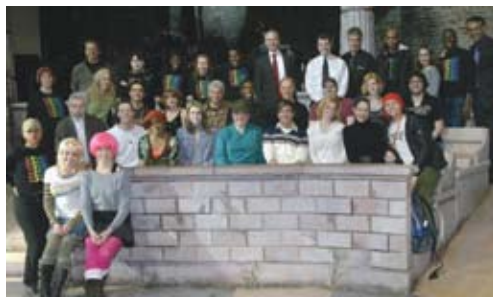
The company of XANADU before their January Special Performance

Jersey Boys , Special Performance, New York