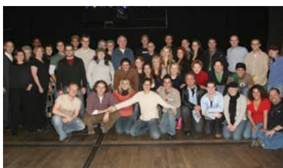
The company of WICKED at The Fund’s December Special Performance

The Actors Fund, for everyone in entertainment Celebrating 125 years.