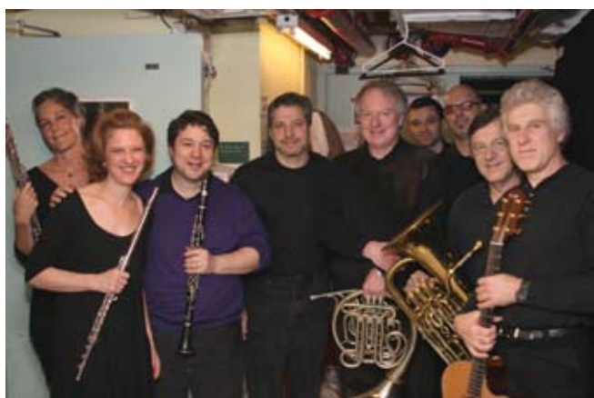
Behind the scenes with the musicians of MARY POPPINS in December