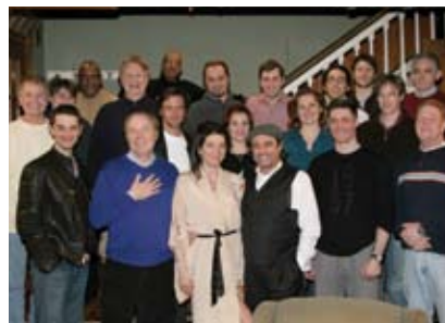
Company of THE HOMECOMING at their April Special Performance