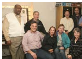
Cast and crew members just before the Special Performance of NOVEMBER