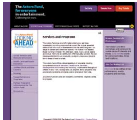
The Actors Fund Website

Depending on the subject area, resources can be accessed by state or through a national directory and all include a brief description and link to a specific website.