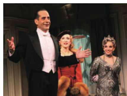
(l-r) Tony Shalhoub (pictured with co-stars Jan Maxwell and Brooke Adams) gives a rousing curtain speech after their recent Special Performance of LEND ME A TENOR

HAIR OLEANNA LOOPED THE MIRACLE WORKER A BEHANDING IN SPOKANE NEXT FALL SONDHEIM ON SONDHEIM