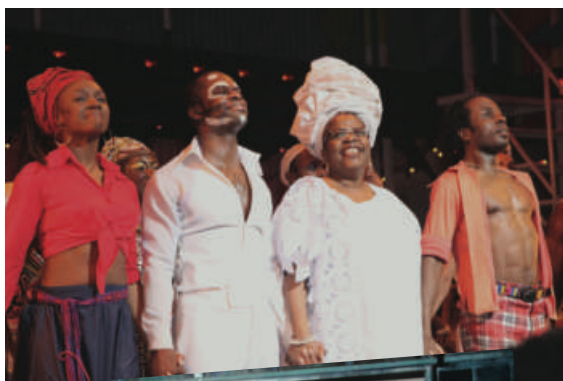
The companies of FELLA! (left), MEMPHIS (below left) and BILLY ELLIOT (below right) gave spectacular Special Performances in early 2010