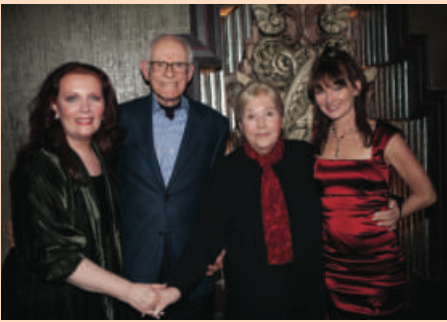
(l-r) Maureen McGovern, Alan & Marilyn Bergman and Lari White