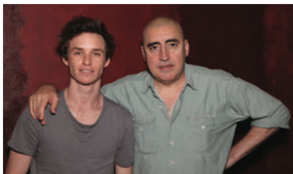
(l-r) Eddie Redmayne and Alfred Molina backstage before their June Special Performance of RED

Actors Fund Special Performances have all the electric energy of an Opening Night and the excitement is felt on both sides of the curtain. Casts from other productions have the opportunity to see the show on their night off while performers in the show play for an audience full of their peers, celebrities from the entertainment community and you! Be a part of the excitement of Special Performances! Order your tickets today at www.actorsfund.org .