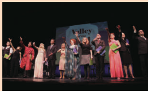
Charles Busch and the full company of Valley of the Dolls